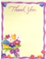
351126 Thank You Flowers