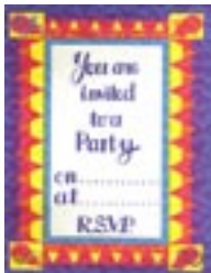
351157 Zig Zag Invites