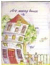
351164 Moving House