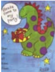
351133 Spotty Monster Invites