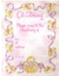
351096 Christening Invites

Fun collection of party pack notepaper, including invitations, christening, thank you and moving.