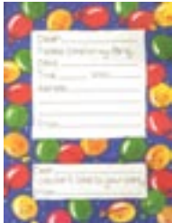
351102 Balloons Invites