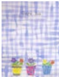
351171 Gingham Thank You