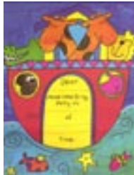
351140 Noah's Ark Invites